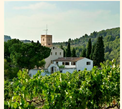
Albet i Noya