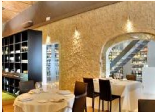
Restaurant Cal Blay